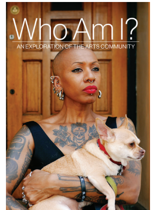
Who Am I?